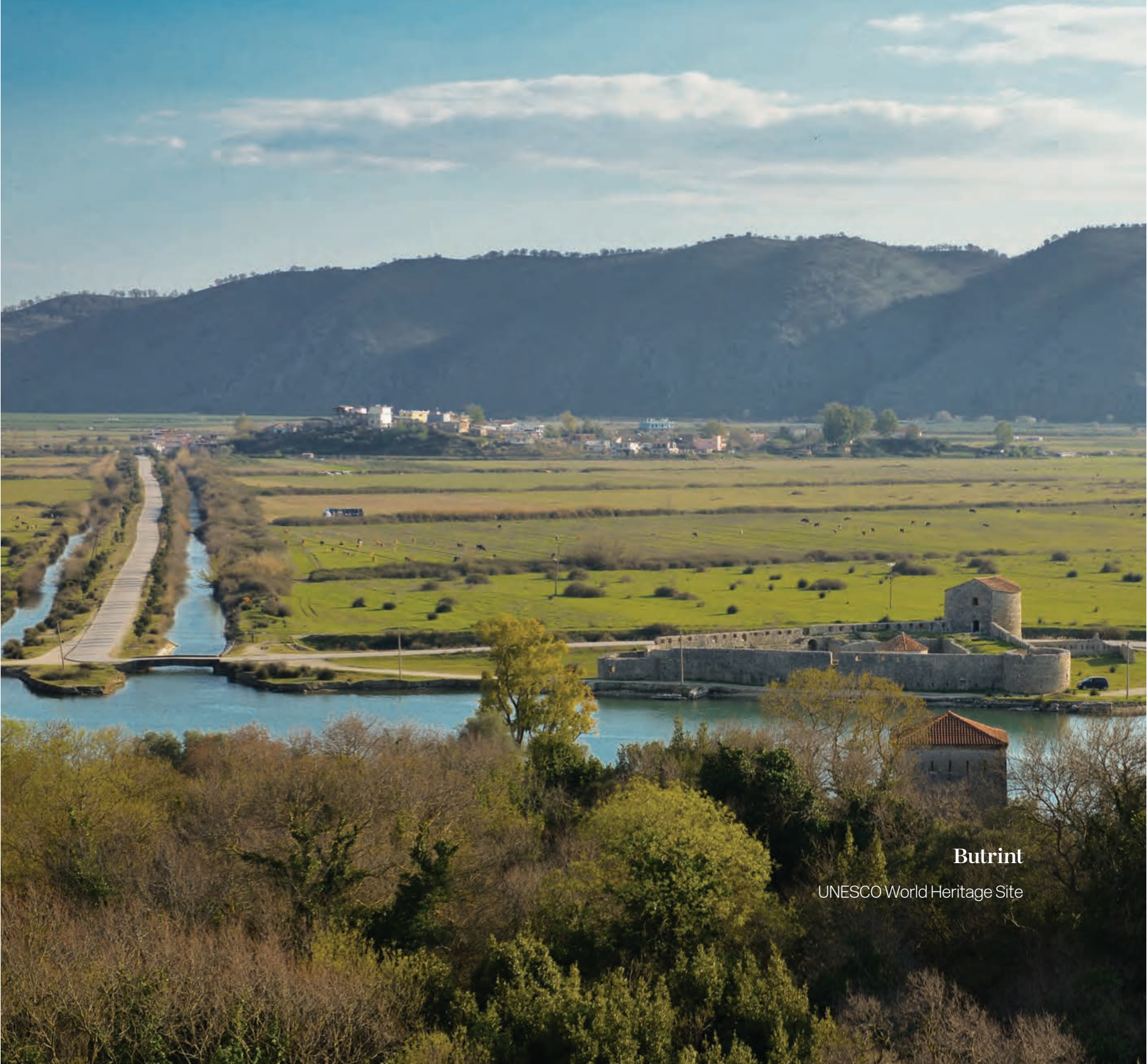
Butrint UNESCO World Heritage Site