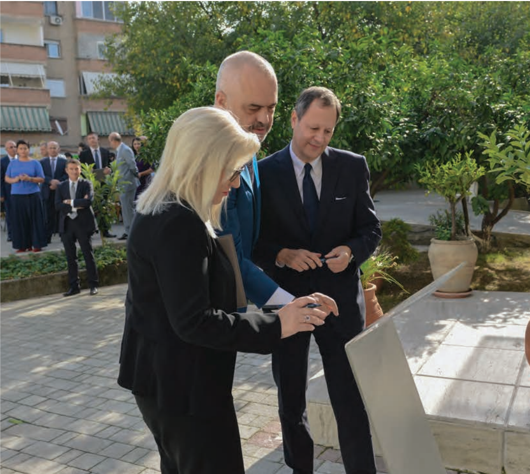
Center for School Leadership

The Center will guarantee that only professionals who have undergone the training and acquired the right certification will be eligible to become school principals.