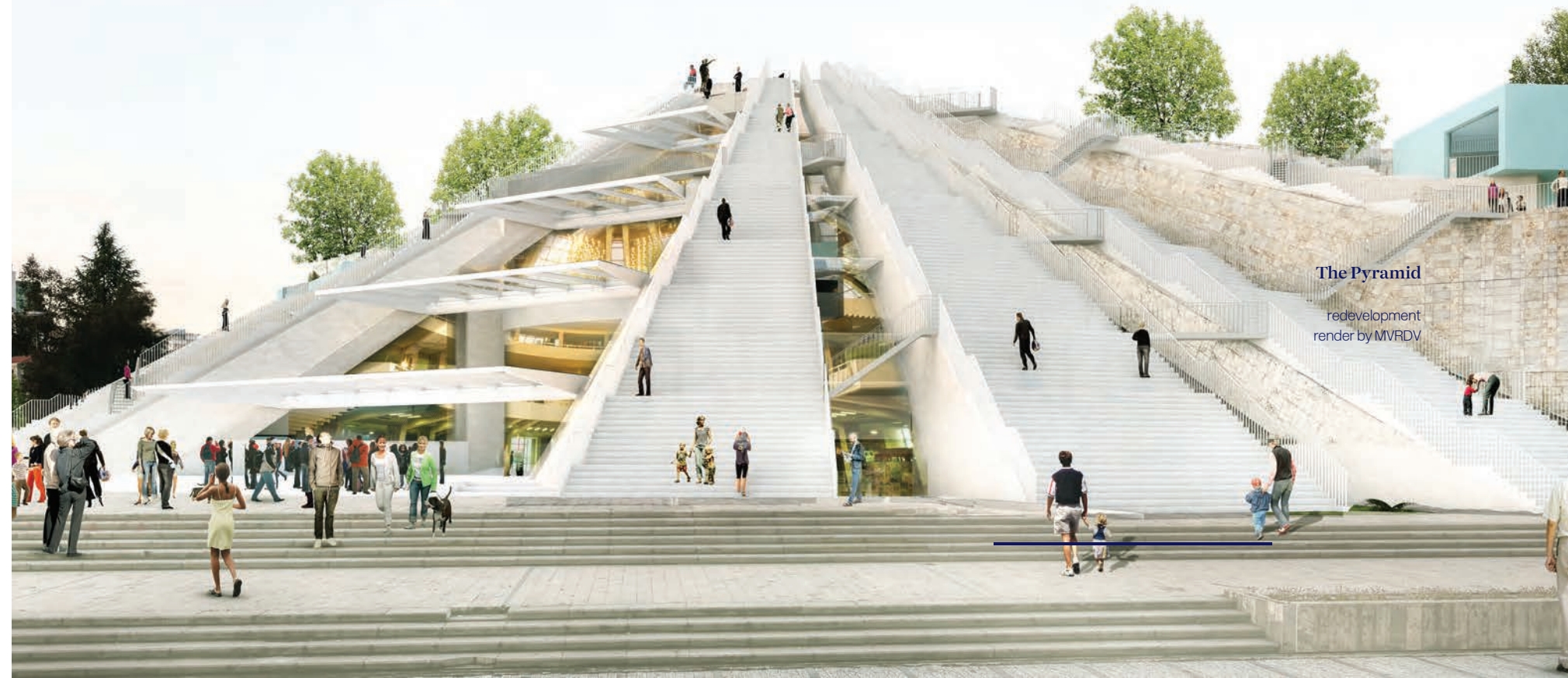
The Pyramid redevelopment render by MVRDV